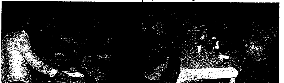
The food and fellowship was great